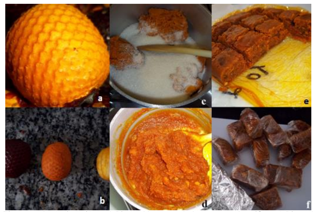
Figure 1 Buriti fruit (A and B), buriti sweet during processing (C and D) and ready-to-eat buriti sweet (E and F).

The buriti pulp was thawed in the refrigerator for 12 hours and the sweets formulated according to the methodology described by Medeiros (2011). The sweets were prepared with buriti from each region (Goiás, Tocantins and Pará). The buriti pulp and sugar were used in a 1:1 proportion and the mixtures boiled for 16 minutes until they reached 82 °Brix. The sweets were then transferred to rectangular (15 x 10 cm) high density polyethylene containers, lined with a transparent PVC film and maintained at room temperature. After 24 hours the sweets were cut into cubes, which were wrapped in transparent PVC film and aluminum foil and frozen at -18 °C until analyzed (Figure 1).